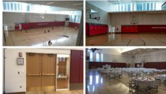
FACILITY INSPECTIONS + OBSERVATIONS