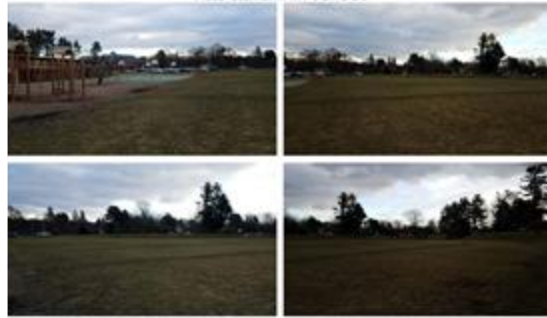
FACILITY INSPECTIONS + OBSERVATIONS