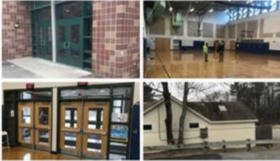
FACILITY INSPECTIONS + OBSERVATIONS