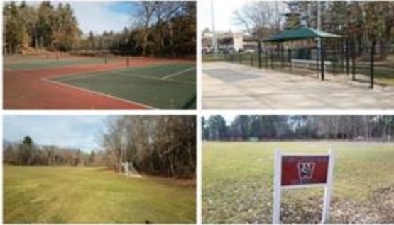
FACILITY INSPECTIONS + OBSERVATIONS