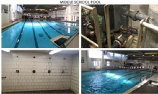
FACILITY INSPECTIONS + OBSERVATIONS