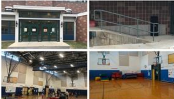
FACILITY INSPECTIONS + OBSERVATIONS