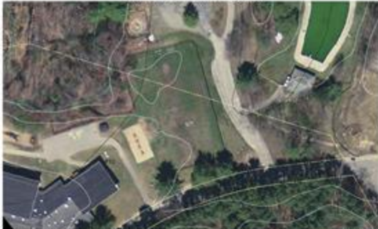
FACILITY INSPECTIONS + OBSERVATIONS