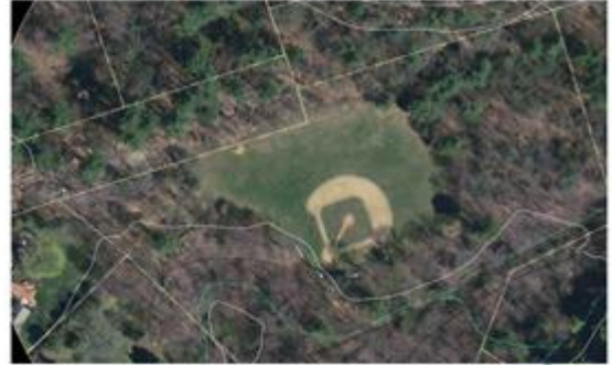
FACILITY INSPECTIONS + OBSERVATIONS