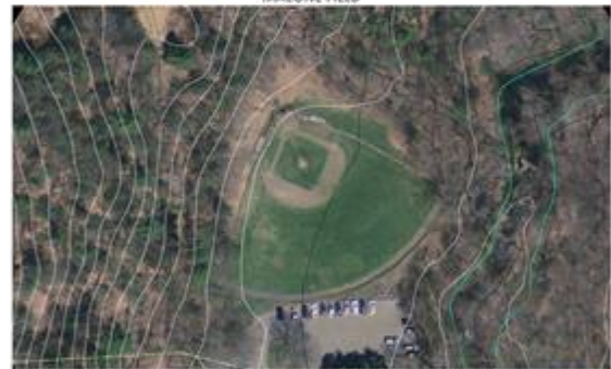
FACILITY INSPECTIONS + OBSERVATIONS