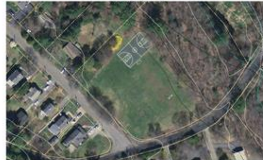
FACILITY INSPECTIONS + OBSERVATIONS