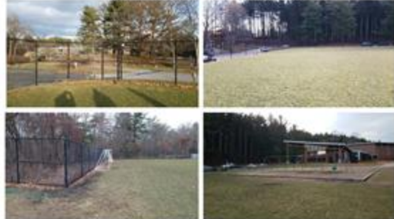
FACILITY INSPECTIONS + OBSERVATIONS