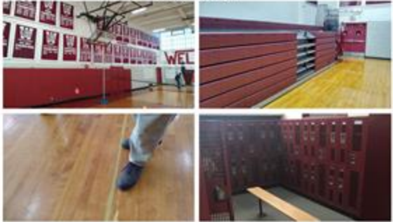
FACILITY INSPECTIONS + OBSERVATIONS