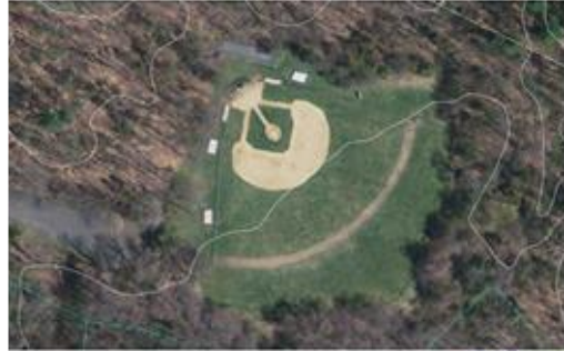
FACILITY INSPECTIONS + OBSERVATIONS