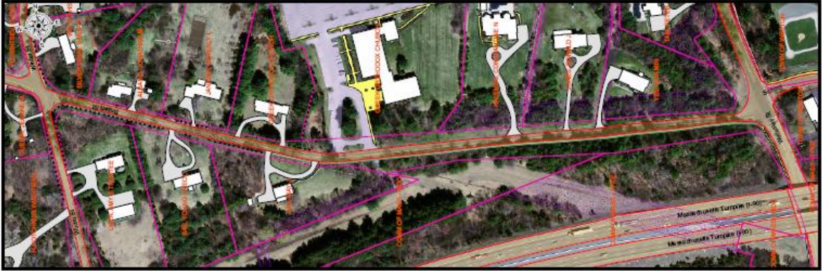
Proposed Sidewalk Location @ Brown St to Winter St