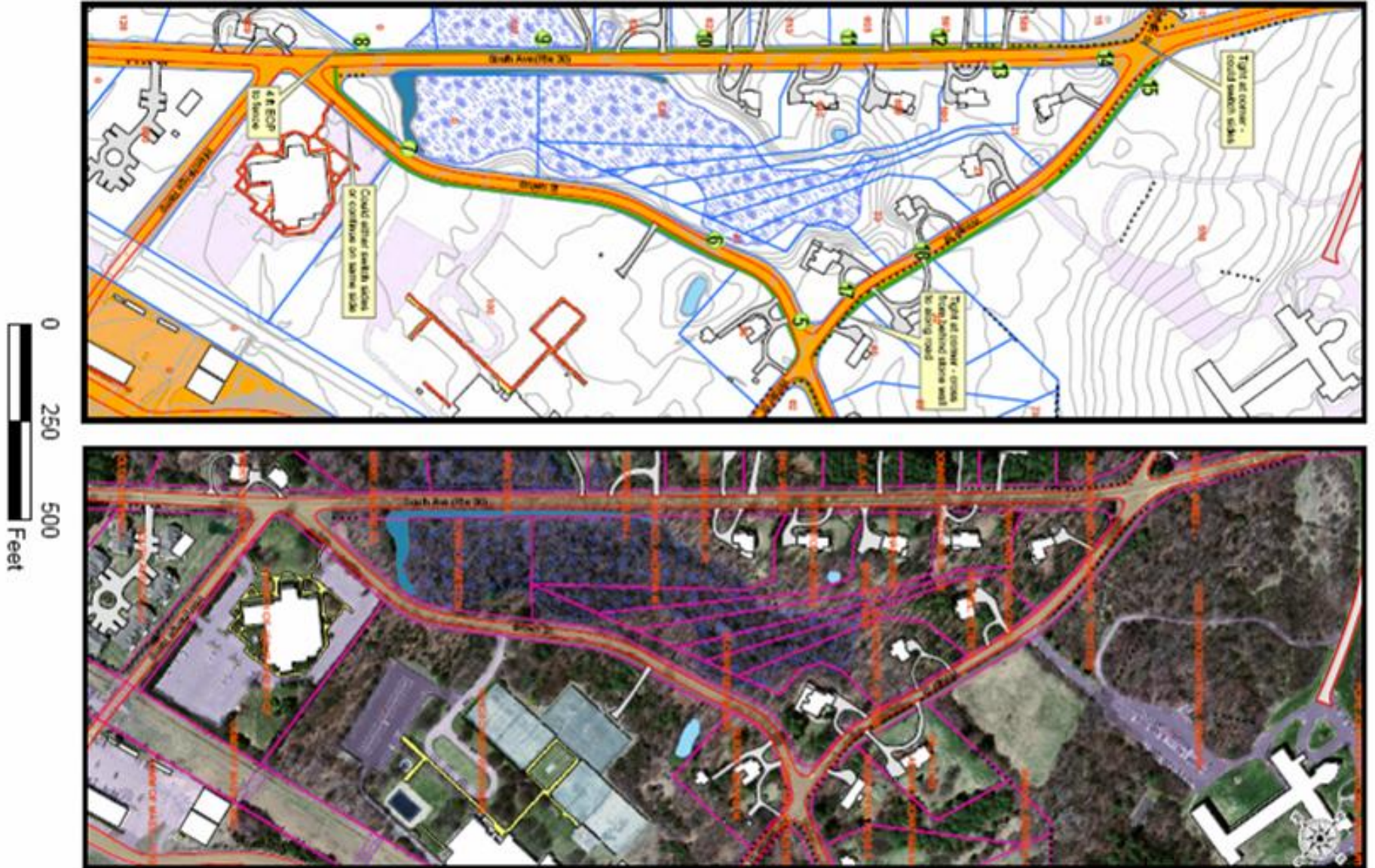
Proposed Sidewalk Location @ Brown St to Winter St to Route 30 Loop