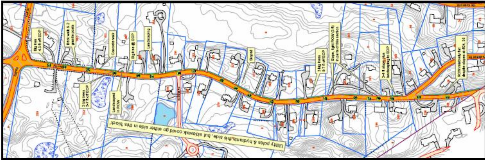
Proposed Sidewalk Location @ Glen Road: Wellesley Border to Cliff / Oak